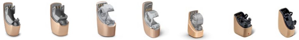
Roger™ 19 Roger™ 18 Roger™ 16 Roger™ 15 Roger™ 13 Roger™ 11 Roger™ 10